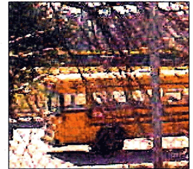
This school bus from Methuen is one example of public money spent at Fistgate II.

The private homosexual sponsor, GLSEN, is given state funds for