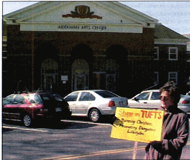
A picket stands outside the building at Tufts where Fistgate was repeated this year.