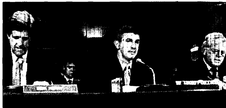
Senators Kerry (left) and Kennedy (right) tried to smooth over Paul Cellucci's problems in Washington, but it took a personal call from the President before his nomination was approved.

Many wonder if Bush was ever informed by his staff of the full extent of the unhappiness across the entire nation because of the Cellucci appointment. They question whether his chief of staff,